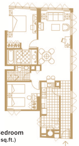
Type 2-Bedroom (1004 sq.ft.)