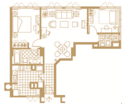
Type 2-Bedroom (981 sq.ft.)