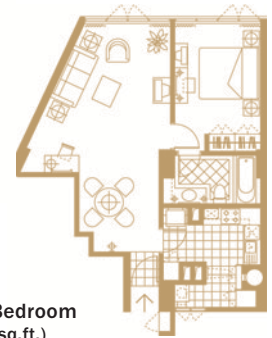
Type 1-Bedroom (800 sq.ft.)